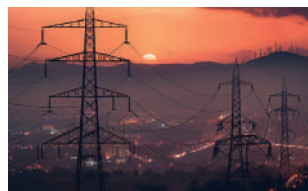
Electric Routine Inspection